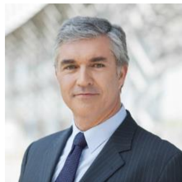
John "Demo" Lender VP of Lending, Demo Mortgage Co.

What if I locked my loan after that fee was announced?