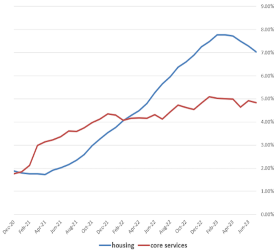
Year Over Year Change