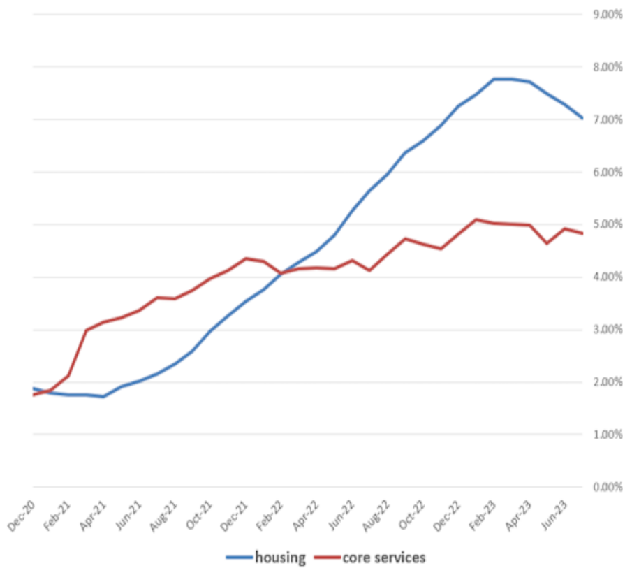
Year Over Year Change