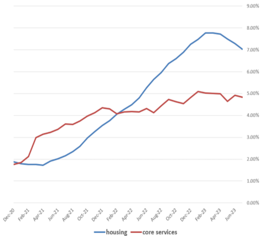
Year Over Year Change