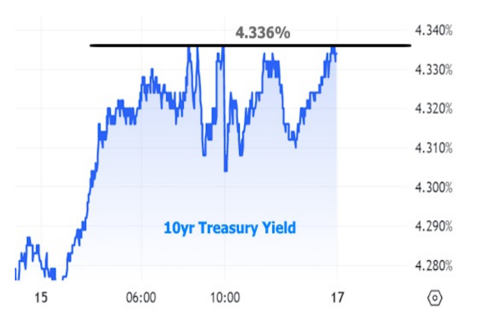
4.34% is where the 10yr ended on August 21st. It remains the highest daily closing level since 2007 so repeated flirtation is important. When a bond yield (or any other financial market security, for that matter) exhibits this bouncy behavior around a previous extreme, it becomes known as a "technical level" by a large portion of the trading community.

Technical levels go by many names (key level, pivot point, inflection point, or simply "ceiling"). A technical level can be a ceiling if it acts like a ceiling, but it can be an inflection point if it is subsequently broken.