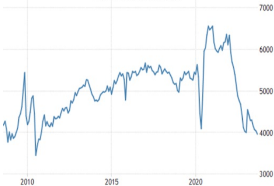
Existing Home Sales

TRADINGECONOMICS.COM | NATIONAL ASSOCIATION OF REALTORS