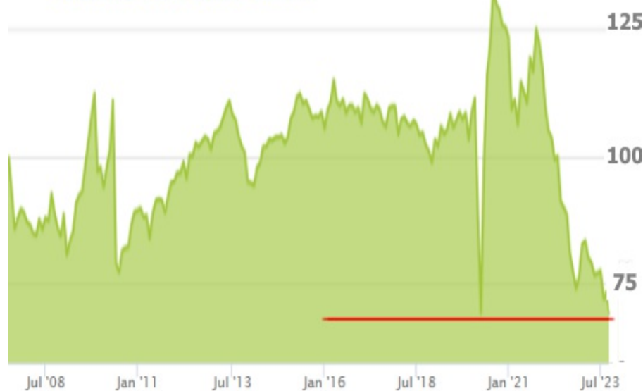
Pending Home Sales Index

Simply put, pending sales had been in a high, stable trend before covid. Demand surged early in the pandemic when rates and prices were lower. Sales dried up quickly as prices and rates soared, AND as fewer sellers were willing to list their homes for sale.