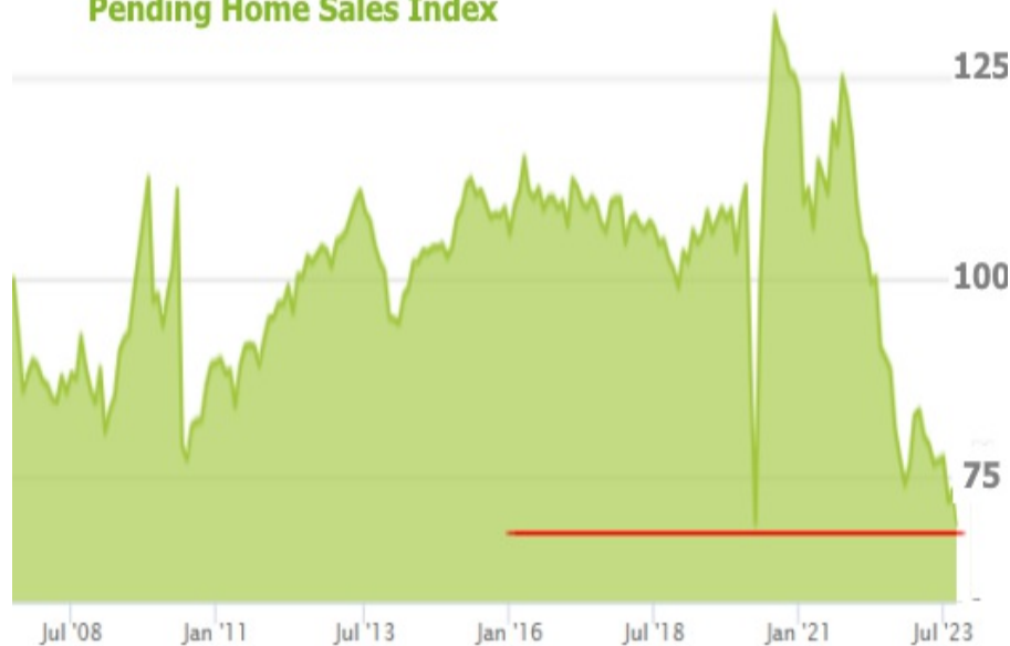
Pending Home Sales Index

Simply put, pending sales had been in a high, stable trend before covid. Demand surged early in the pandemic when rates and prices were lower. Sales dried up quickly as prices and rates soared, AND as fewer sellers were willing to list their homes for sale.