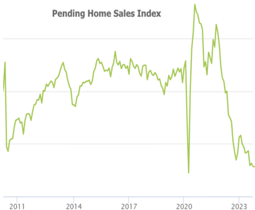
Pending Home Sales Index

Incidentally, that thesis is supported by some of the only economic data released this week. Pending Home Sales came out perfectly unchanged from last month, but still at the lowest levels in a long time (not counting the 2020 lockdowns). Note that most of the move down to these lows occurred in 2022, before extending just a bit more in 2023.