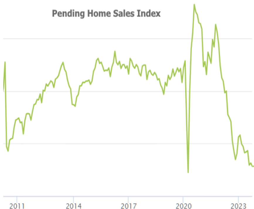
Pending Home Sales Index

It's a similar story for interest rates. 2022 was marked by the largest change in mortgage rates in a single year since 1981, but 2023 took the outright levels just a bit higher.