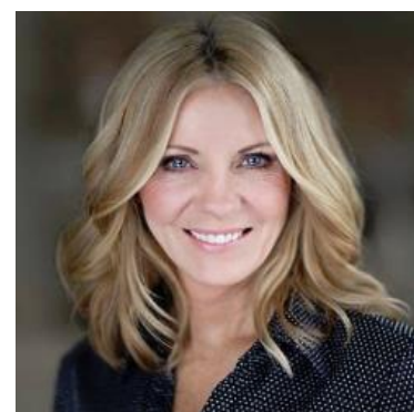
Christina "Demo" Realtor

Managing Partner, Real Estate Company, LLC.