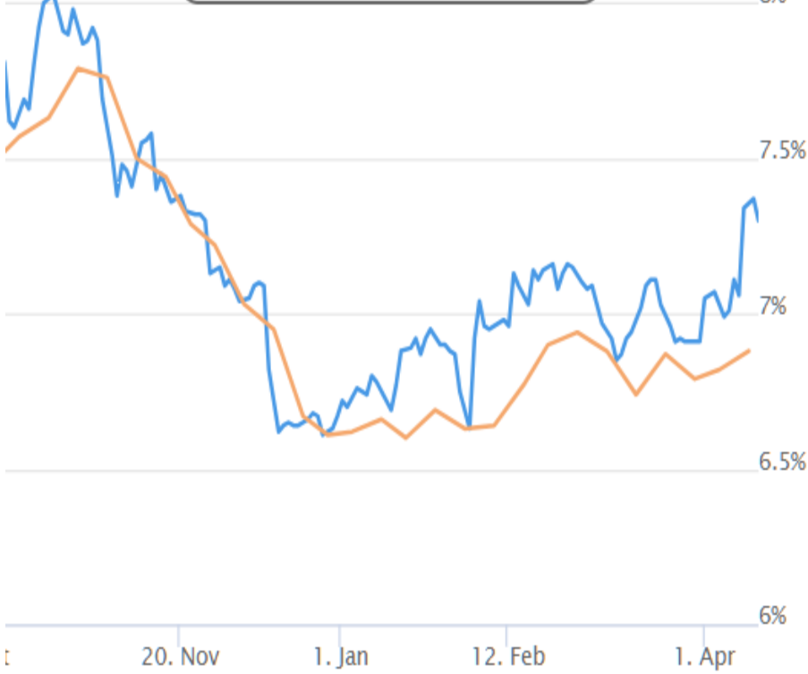
Mortgage Rate Indices --MND, Actual Daily Average --Freddie Mac, Weekly Survey

Why did we see such a big reaction for such a small deviation in the data? Simply put, the market keeps waiting for a trend toward lower inflation to resume and the data keeps breaking hearts. This week's report was sort of a "third times the charm" moment. Jan and Feb CPI (released in Feb and Mar, respectively) were also surprisingly high. They did damage to rates to be sure, but markets and even officials from the Federal Reserve were hoping those reports were outliers.