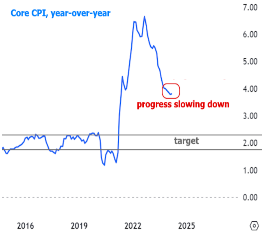
Core CPI, year-over-year

The big question is what it takes for progress to resume. The Fed's answer is "just a bit more time." They are still talking about cutting rates in 2024, but not as early in the year as initially expected. Wall Street is mixed in its expectations, with firms expecting anywhere from 0 to 3 cuts.