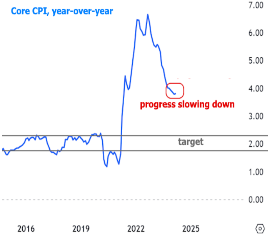
Core CPI, year-over-year

The big question is what it takes for progress to resume. The Fed's answer is "just a bit more time." They are still talking about cutting rates in 2024, but not as early in the year as initially expected. Wall Street is mixed in its expectations, with firms expecting anywhere from 0 to 3 cuts.