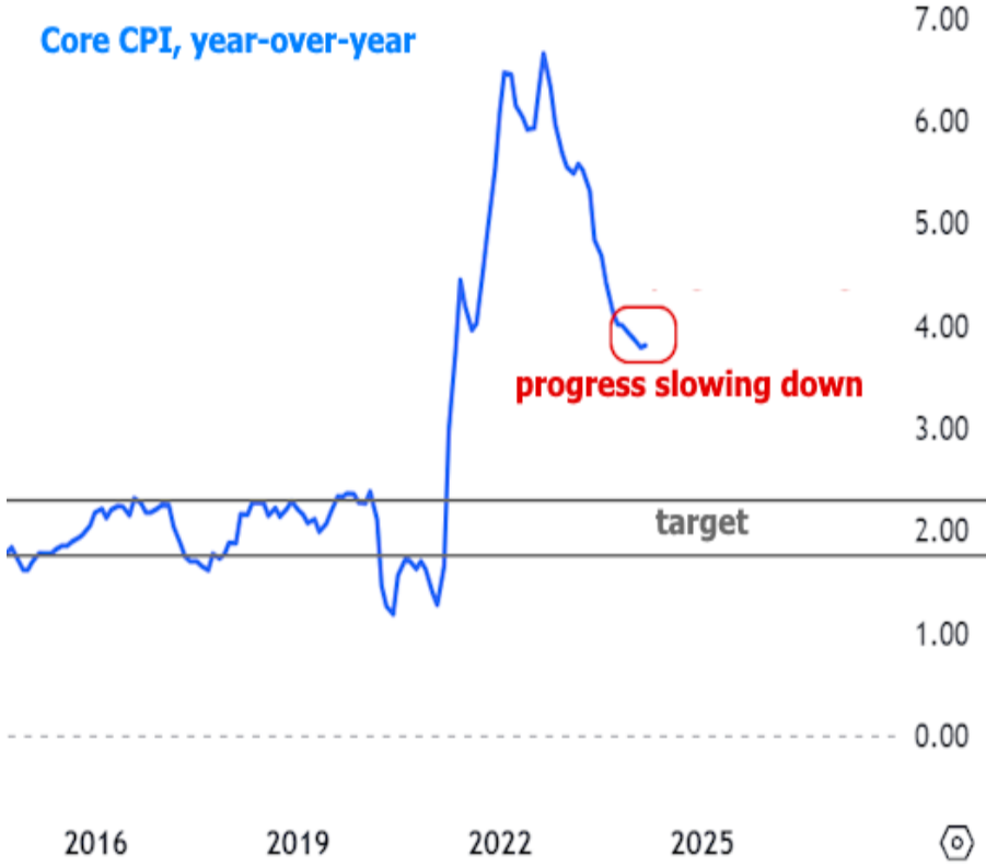
Core CPI, year-over-year

The big question is what it takes for progress to resume. The Fed's answer is "just a bit more time." They are still talking about cutting rates in 2024, but not as early in the year as initially expected. Wall Street is mixed in its expectations, with firms expecting anywhere from 0 to 3 cuts.