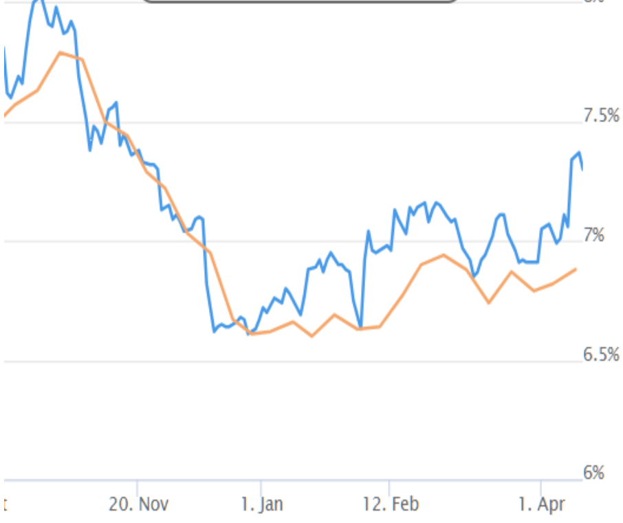
Mortgage Rate Indices --MND, Actual Daily Average --Freddie Mac, Weekly Survey

Why did we see such a big reaction for such a small deviation in the data? Simply put, the market keeps waiting for a trend toward lower inflation to resume and the data keeps breaking hearts. This week's report was sort of a "third times the charm" moment. Jan and Feb CPI (released in Feb and Mar, respectively) were also surprisingly high. They did damage to rates to be sure, but markets and even officials from the Federal Reserve were hoping those reports were outliers.