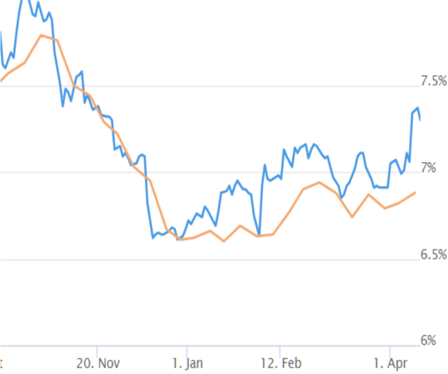
Mortgage Rate Indices --MND, Actual Daily Average --Freddie Mac, Weekly Survey

Why did we see such a big reaction for such a small deviation in the data? Simply put, the market keeps waiting for a trend toward lower inflation to resume and the data keeps breaking hearts. This week's report was sort of a "third times the charm" moment. Jan and Feb CPI (released in Feb and Mar, respectively) were also surprisingly high. They did damage to rates to be sure, but markets and even officials from the Federal Reserve were hoping those reports were outliers.