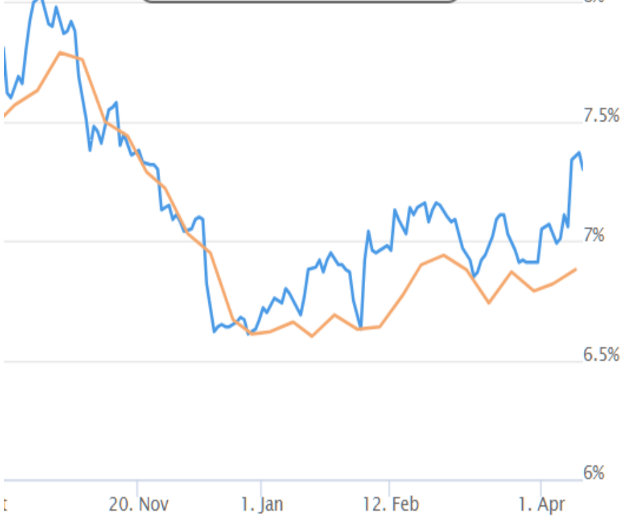
Mortgage Rate Indices --MND, Actual Daily Average --Freddie Mac, Weekly Survey

Why did we see such a big reaction for such a small deviation in the data? Simply put, the market keeps waiting for a trend toward lower inflation to resume and the data keeps breaking hearts. This week's report was sort of a "third times the charm" moment. Jan and Feb CPI (released in Feb and Mar, respectively) were also surprisingly high. They did damage to rates to be sure, but markets and even officials from the Federal Reserve were hoping those reports were outliers.