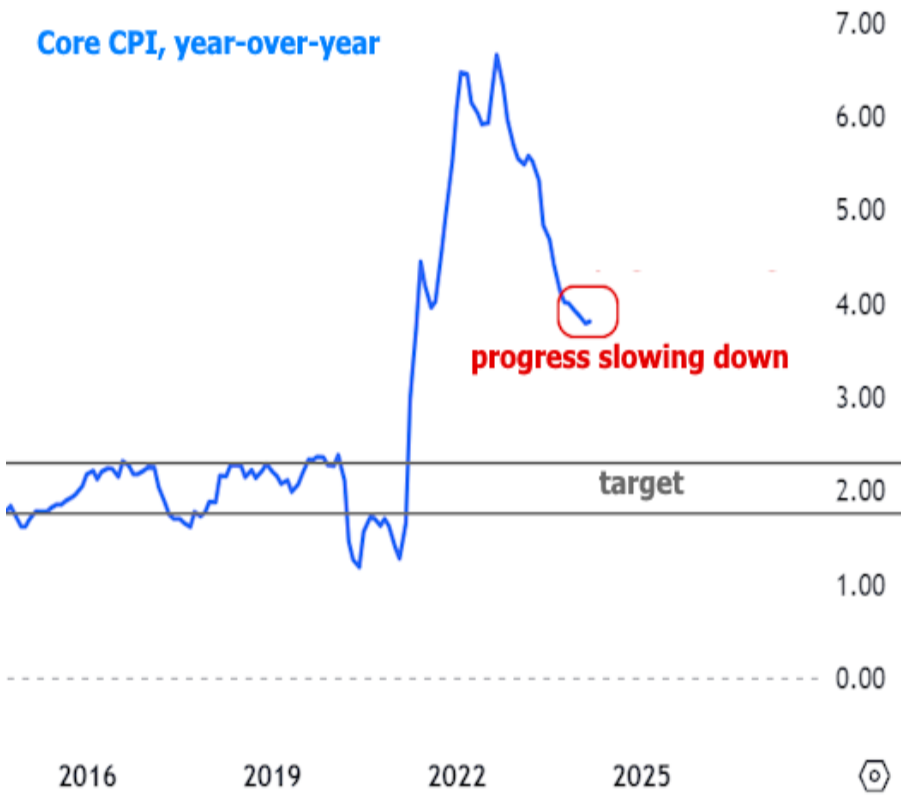
Core CPI, year-over-year

The big question is what it takes for progress to resume. The Fed's answer is "just a bit more time." They are still talking about cutting rates in 2024, but not as early in the year as initially expected. Wall Street is mixed in its expectations, with firms expecting anywhere from 0 to 3 cuts.