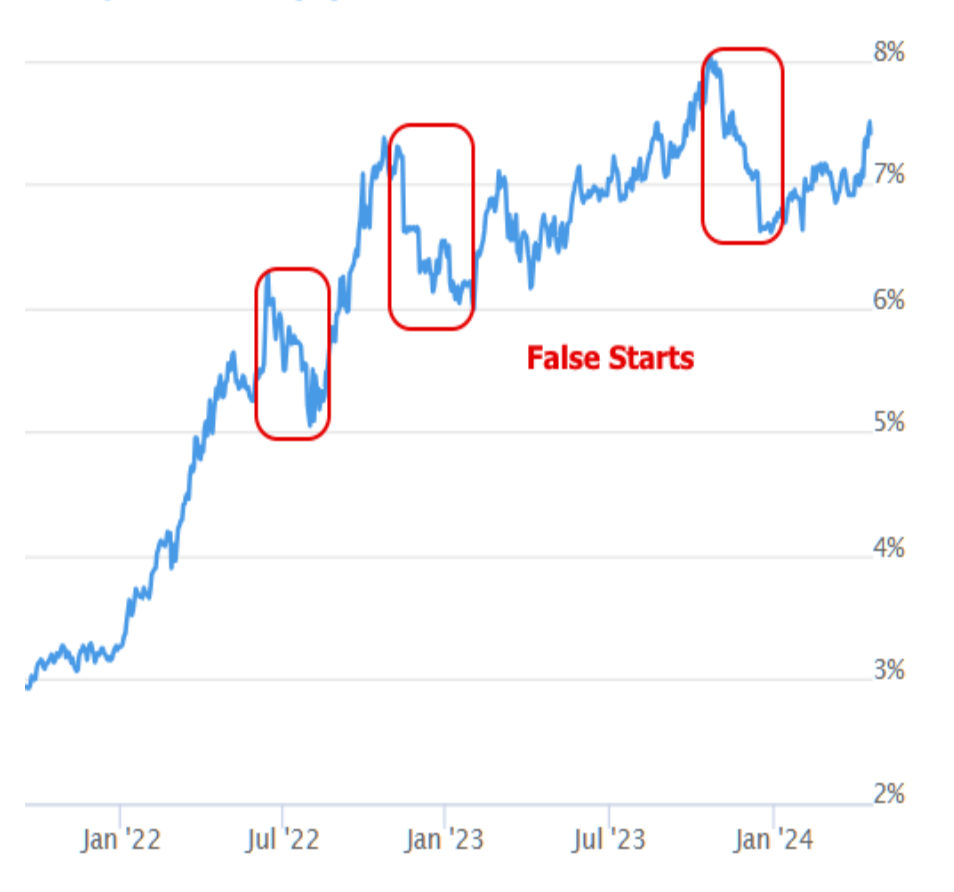
In the meantime, home sales remain constrained.