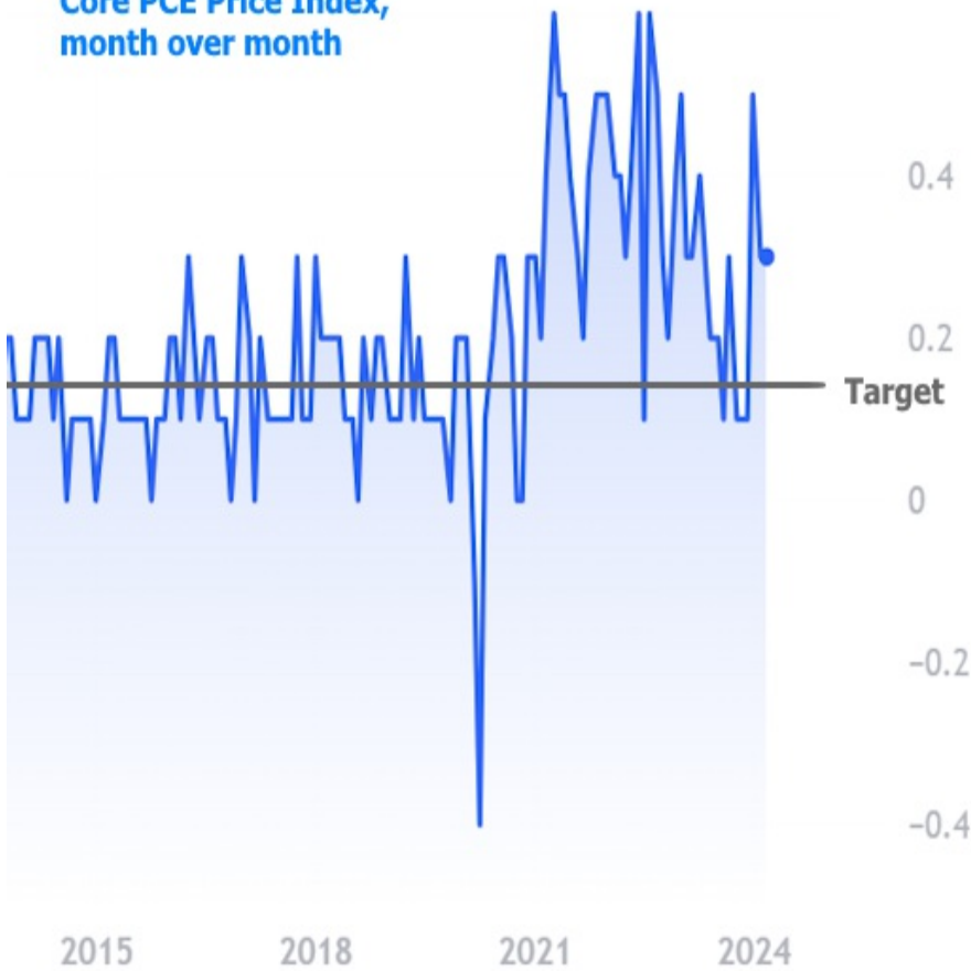
Core PCE Price Index, month over month

Some people get upset when economic data is revised in a way that makes it seem like the government tried to paint a rosier picture for initial releases. In addition to numerous examples of past revisions having a completely opposite effect, rest assured, the financial market sees all the moving parts and trades accordingly. Specifically, even after the softer data came out on Friday, bond yields (a fancy word for "rates") were still higher than they were before the previous day's data and significantly higher than the lows seen on Tuesday after PMI data.