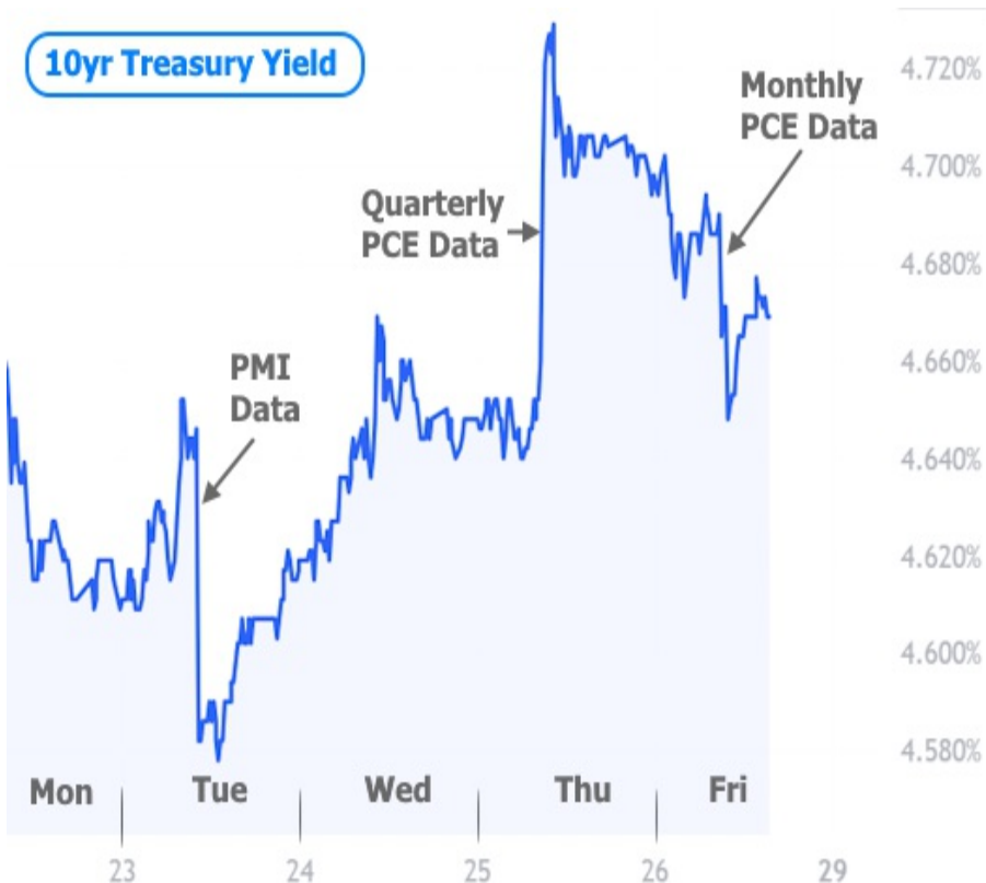
10yr Treasury Yield

Some people get upset when economic data is revised in a way that makes it seem like the government tried to paint a rosier picture for initial releases. In addition to numerous examples of past revisions having a completely opposite effect, rest assured, the financial market sees all the moving parts and trades accordingly. Specifically, even after the softer data came out on Friday, bond yields (a fancy word for "rates") were still higher than they were before the previous day's data and significantly higher than the lows seen on Tuesday after PMI data.