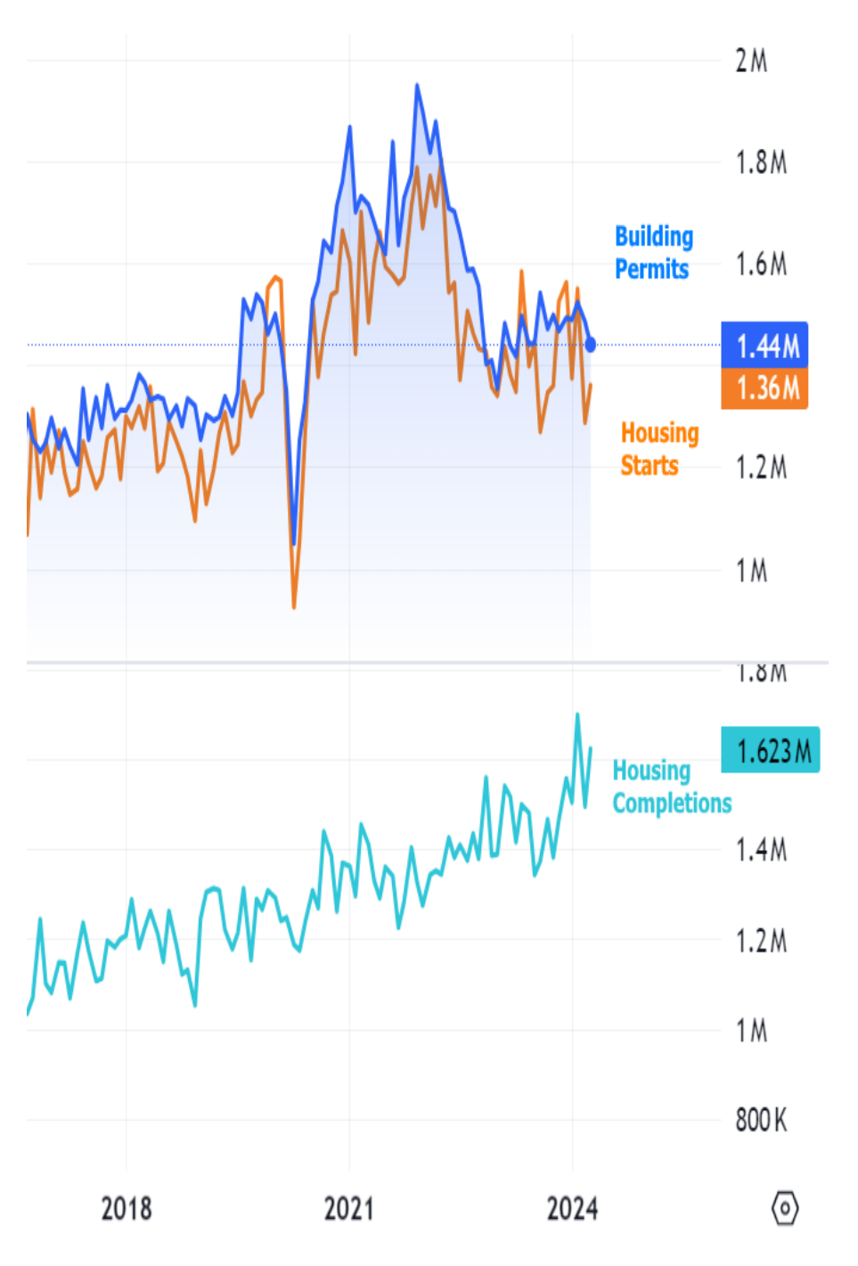
Zooming out a bit more, the takeaway isn't much different, but it adds context from the previous highs and also shows starts and permits remaining near pre-covid highs.