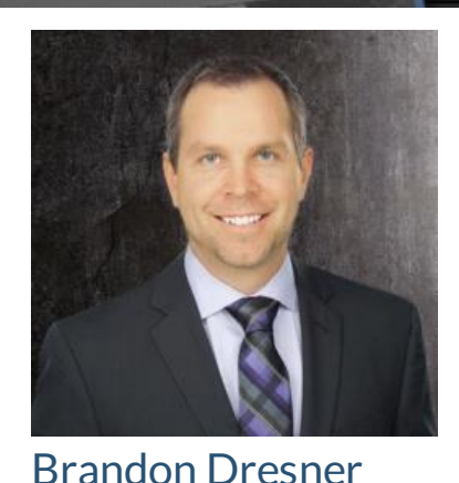
Mortgage Broker, AWay Home Loans www.AWayHomeLoans.com 148535