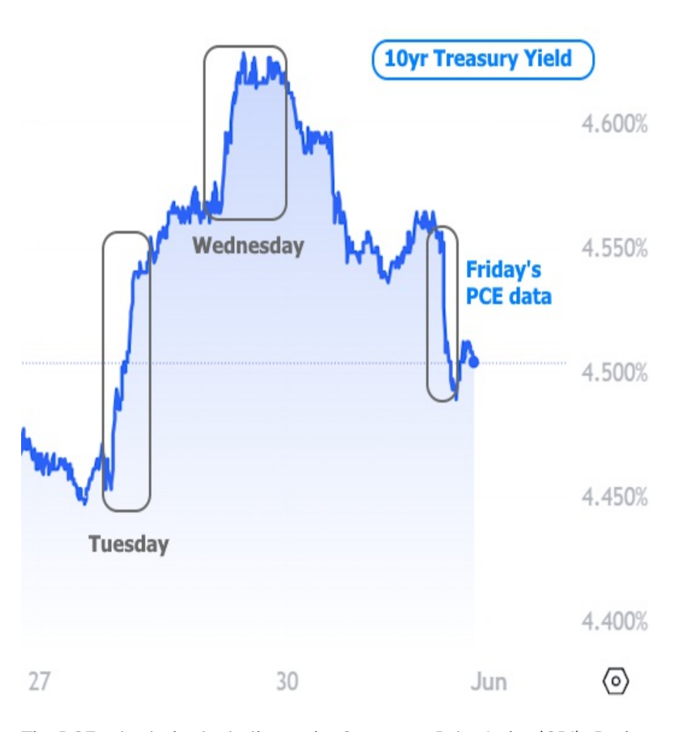
The PCE price index is similar to the Consumer Price Index (CPI). Both are official government measures of inflation. PCE is released 2 weeks after CPI. As such, it tends to produce less volatility, but the Fed actually prefers it to CPI when it comes to assessing the 2% inflation target.