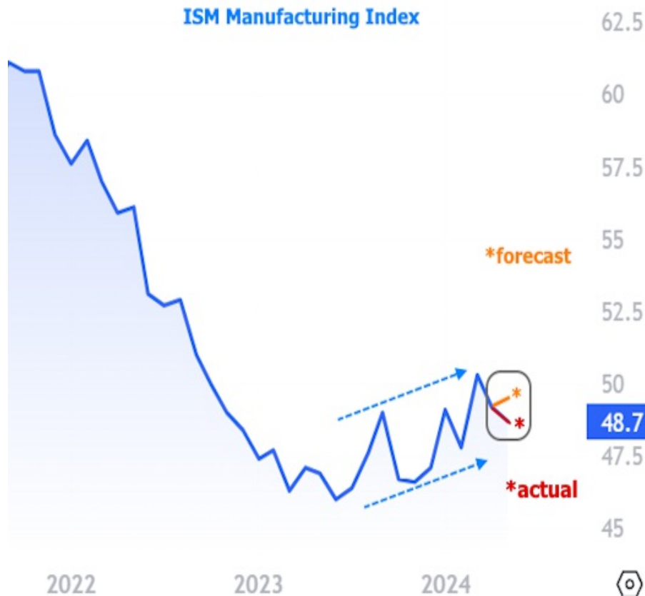
ISM Manufacturing Index

In fact, the size of the reaction to Monday's ISM data is one of the best reasons to investigate other variables. These could include follow-through momentum from last Friday's rate-friendly reaction to the PCE inflation data as well as more esoteric motivations surrounding the change of one calendar month to the next.