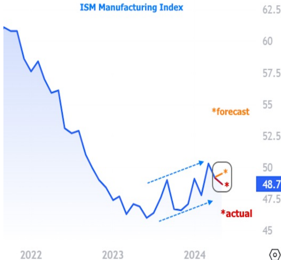
ISM Manufacturing Index

In fact, the size of the reaction to Monday's ISM data is one of the best reasons to investigate other variables. These could include follow-through momentum from last Friday's rate-friendly reaction to the PCE inflation data as well as more esoteric motivations surrounding the change of one calendar month to the next.