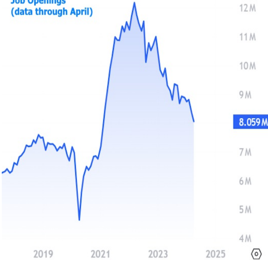
Job Openings (data through April)

Wednesday brought the service sector version of the ISM PMI data, shockingly titled "Services PMI." The bond market tends to react to this one more than the manufacturing version, so traders had plenty to consider when the numbers came out much higher than expected (i.e. bad for rates).