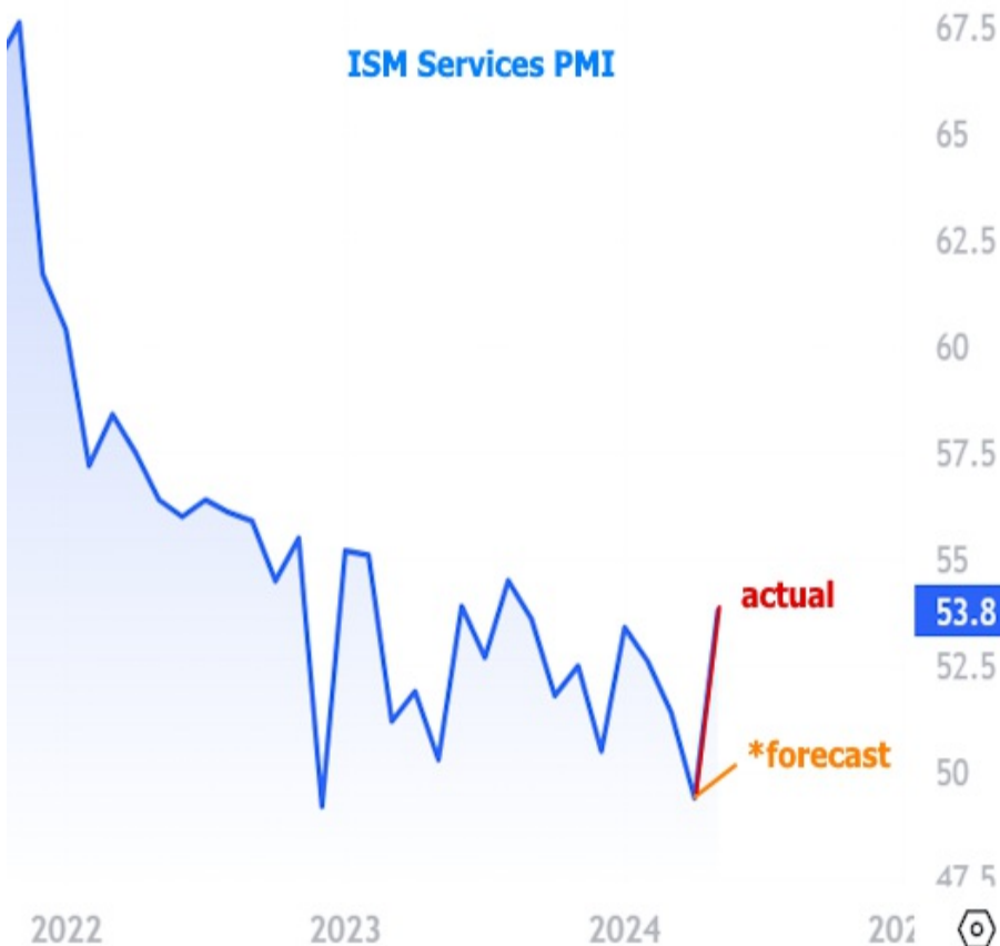
ISM Services PMI

Wednesday brought the service sector version of the ISM PMI data, shockingly titled "Services PMI." The bond market tends to react to this one more than the manufacturing version, so traders had plenty to consider when the numbers came out much higher than expected (i.e. bad for rates).