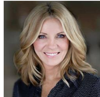
Christina "Demo" Realtor

Managing Partner, Real Estate Company, LLC.