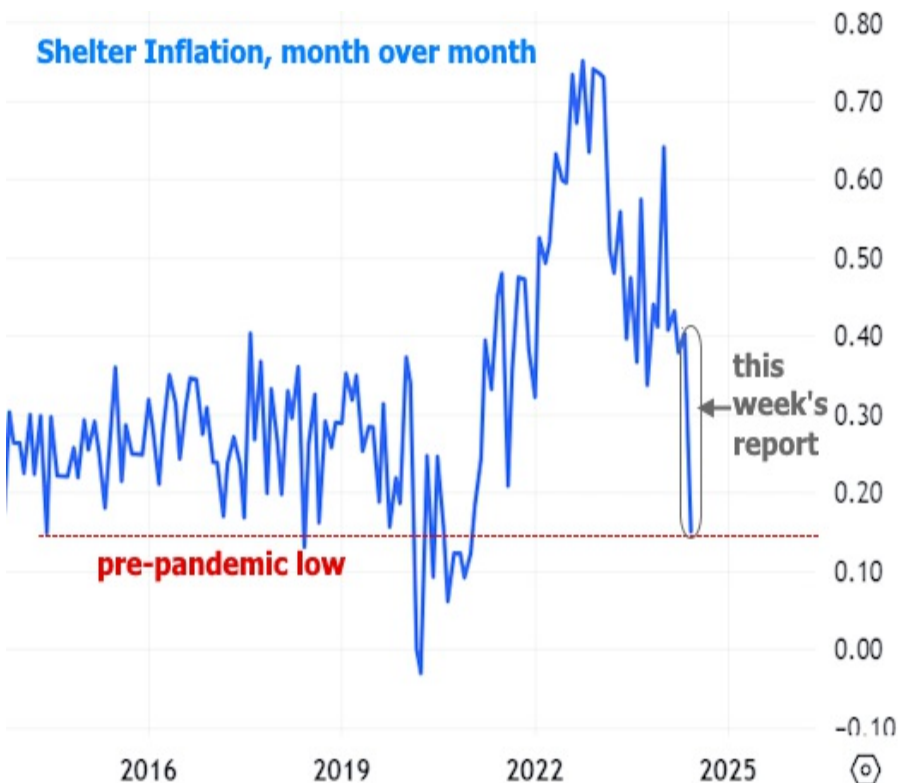
Shelter Inflation, month over month

One of the persistent "yeah buts" that has held investors back from believing in the sustainability of low inflation readings has been elevated housing inflation. CPI measures this under the "shelter" category, which had fizzled sideways at levels that were too high for the Fed's liking for months and months. This week's data not only marked the first big break below that "fizzle" range, but it also showed shelter inflation back at the lower end of the pre-pandemic range. Even if it drops no further from here, this is fertile soil for Fed rate cuts.