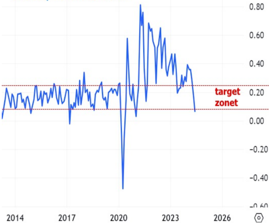
Core CPI, month over month

As the chart suggests, we can also say that monthly core inflation is not only the lowest it's been since topping out in 2021, but it's also in line with the lowest levels seen in more than a decade, initial covid lockdown months notwithstanding.