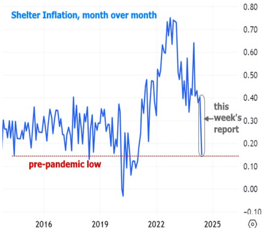
Shelter Inflation, month over month

One of the persistent "yeah buts" that has held investors back from believing in the sustainability of low inflation readings has been elevated housing inflation. CPI measures this under the "shelter" category, which had fizzled sideways at levels that were too high for the Fed's liking for months and months. This week's data not only marked the first big break below that "fizzle" range, but it also showed shelter inflation back at the lower end of the pre-pandemic range. Even if it drops no further from here, this is fertile soil for Fed rate cuts.