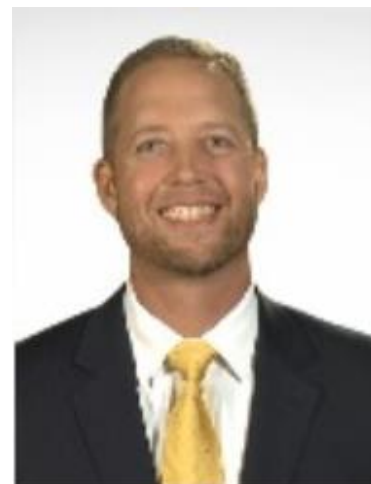
MLO, US Bank

In the market's defense, bond yields--a proxy for mortgage rates--moved higher initially, but then proceeded to drop to the week's lowest levels in 4 months by the end of the day. Rates fell again on Wednesday and then moved gradually higher through the end of the week.