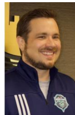
President, Owner, River City Mortgage, LLC

In the market's defense, bond yields--a proxy for mortgage rates--moved higher initially, but then proceeded to drop to the week's lowest levels in 4 months by the end of the day. Rates fell again on Wednesday and then moved gradually higher through the end of the week.