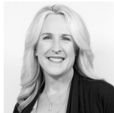
Mortgage Advisor, Peerless Lending

In the market's defense, bond yields--a proxy for mortgage rates--moved higher initially, but then proceeded to drop to the week's lowest levels in 4 months by the end of the day. Rates fell again on Wednesday and then moved gradually higher through the end of the week.