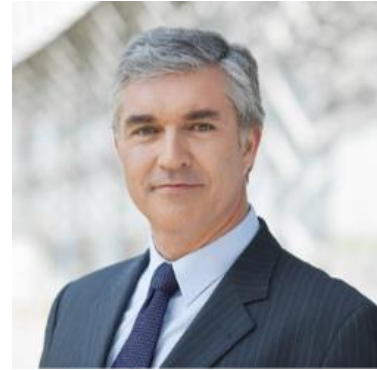
John "Demo" Lender VP of Lending, Demo Mortgage Co.