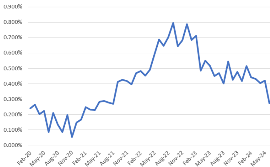
Housing Inflation in PCE % Chg, m/m

The following heat map shows another way to visualize the progress: