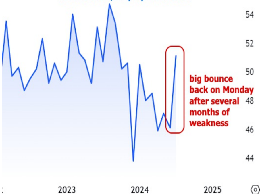
ISM Services, Employment Index

Economic data helped fuel the reversal, with ISM's Services Index and US Jobless Claims helping push back on the recessionary vibes in last week's data.