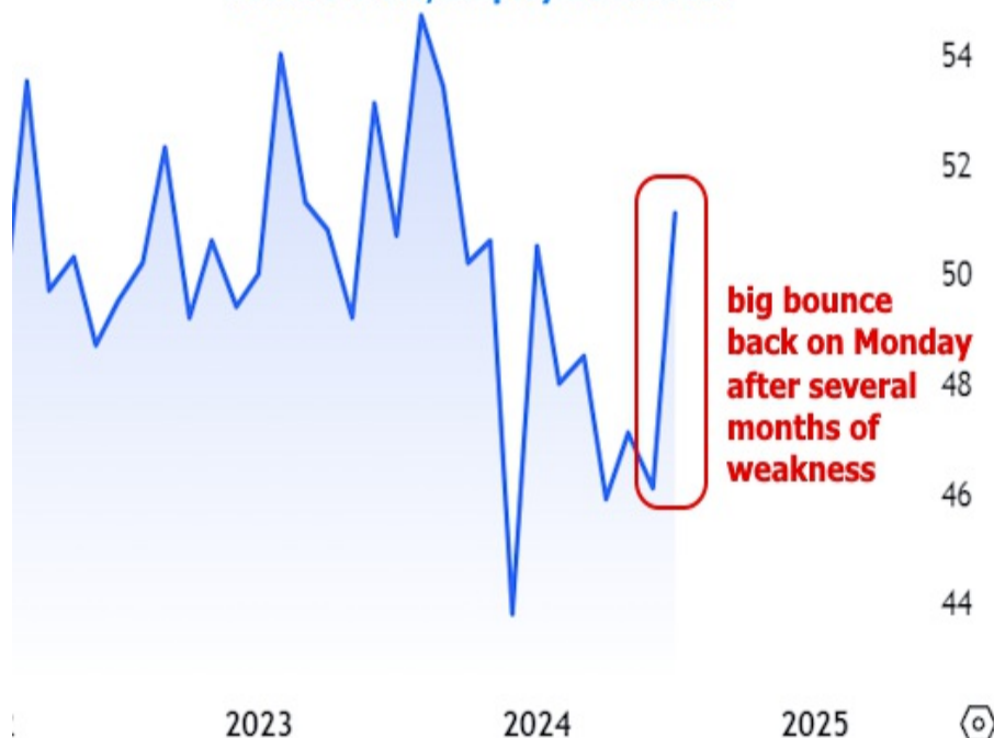
ISM Services, Employment Index