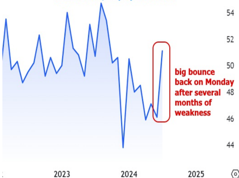
ISM Services, Employment Index

Economic data helped fuel the reversal, with ISM's Services Index and US Jobless Claims helping push back on the recessionary vibes in last week's data.