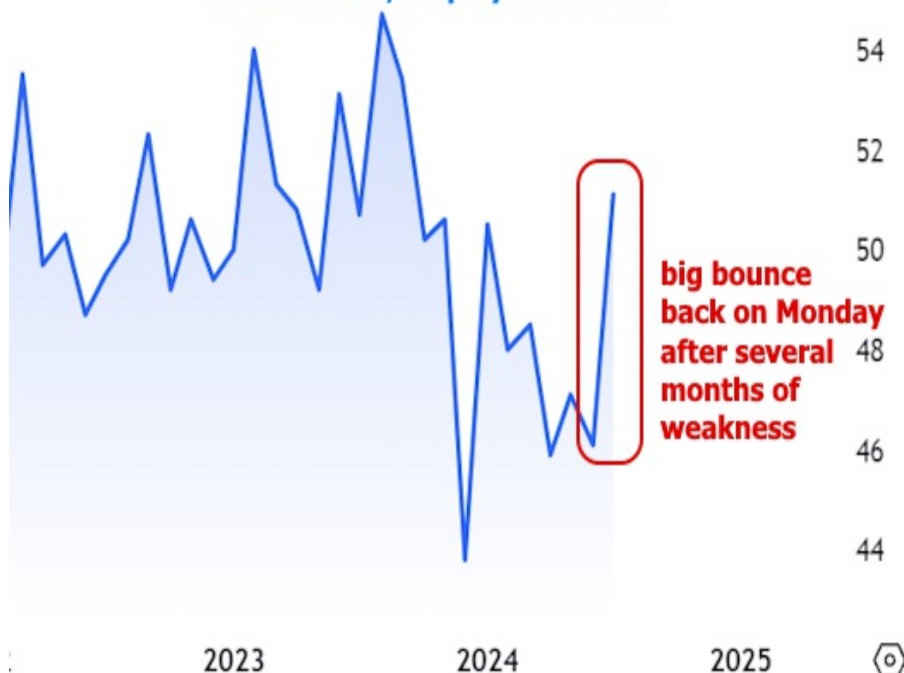
ISM Services, Employment Index

Economic data helped fuel the reversal, with ISM's Services Index and US Jobless Claims helping push back on the recessionary vibes in last week's data.