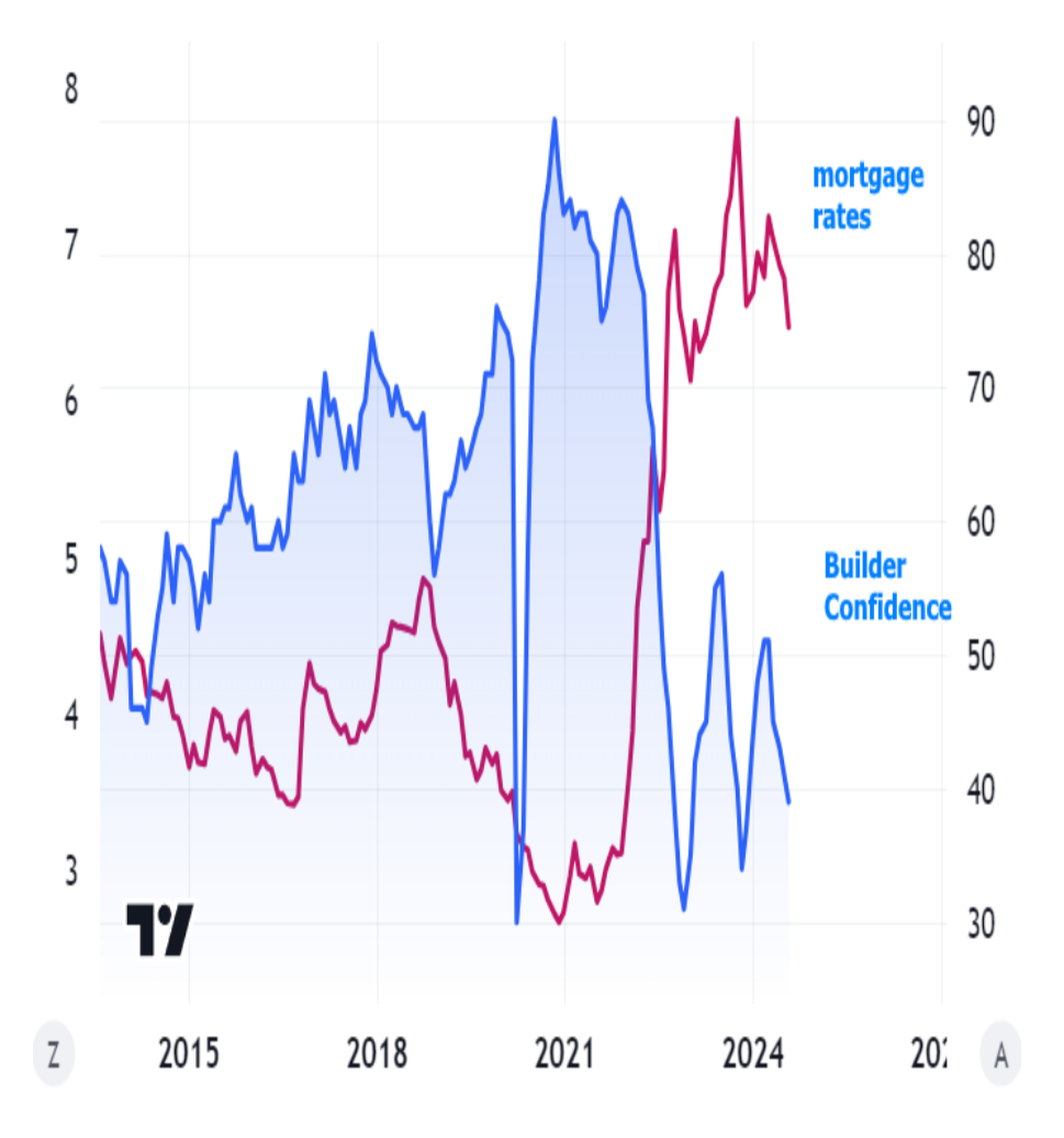
If we invert the red line (such that higher interest rates are at the bottom of the chart), we can see just how strong the correlation is.