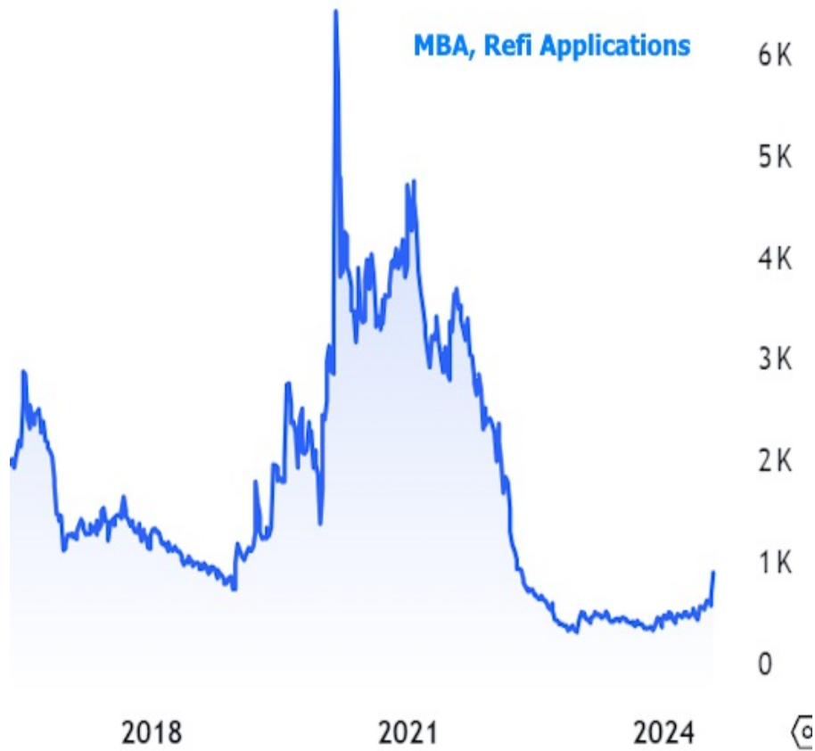
MBA, Refi Applications

That may not look too "mini" at first glance, but context is important.