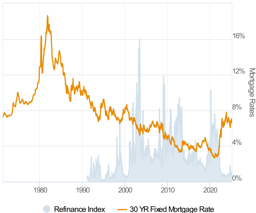
● Refinance Index — 30 YR Fixed Mortgage Rate