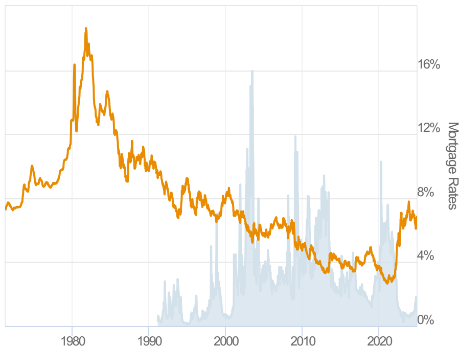
● Refinance Index — 30 YR Fixed Mortgage Rate

200 Union Blvd Lakewood Colorado 80228 1226157