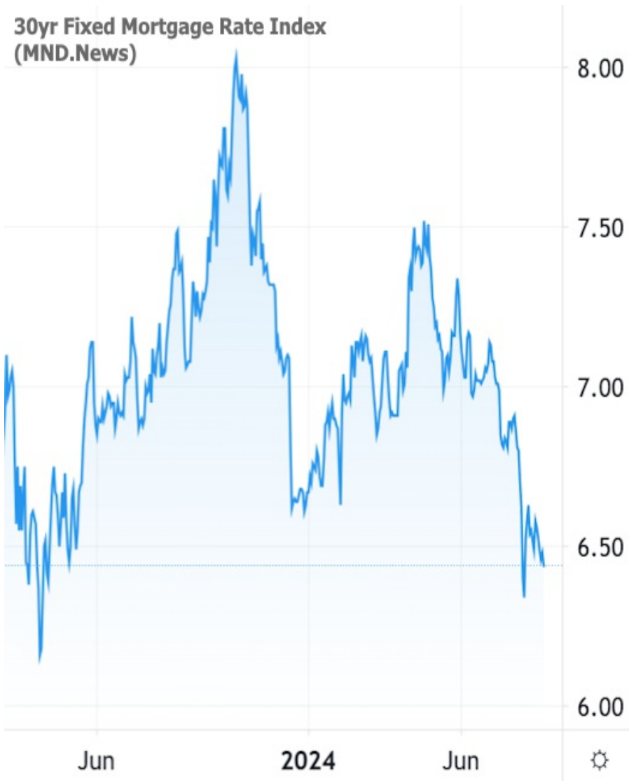
30yr Fixed Mortgage Rate Index (MND.News)

Despite the apparent clarity at the moment, it's good to keep the recent dichotomy in the data in mind. On the one hand, we had weak economic data in early August that helped drive rate expectations as low as they were. On the other hand, the economic reports in the following weeks helped push rates quickly back in the other direction. Since then, we've been consolidating in a narrower, relatively calmer range as seen in the chart of 10yr Treasury yields below.