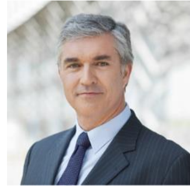
John "Demo" Lender VP of Lending, Demo Mortgage Co.