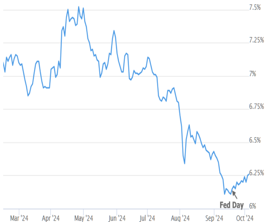
30yr Fixed Mortgage Rate Index, MND.NEWS

Today was just another day in that regard, although it was one of the bigger bumps in the road if we look at today's highest rates versus yesterday's lowest (Wednesday saw higher rates in the morning and lower rates in the afternoon. Thursday was the opposite pattern). Lenders increasingly increased rates throughout the day after an important economic report (ISM Services) showed much stronger than expected growth.