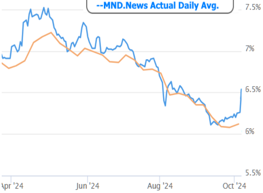
30yr Fixed Mortgage Rate Indices --Freddie Mac Weekly Survey --MND.News Actual Daily Avg.

The most important headline in the jobs report is nonfarm payrolls (NFP), which is a count of new jobs created in the most recent month (September, in this case). Not only did September's 254k payrolls crush forecasts calling for 140k, but the past 2 months were revised higher as well. This is important because recent payroll data factored into the Fed's decision to cut rates by 0.50% two weeks ago. Whereas the trend looked to be trailing off at weaker and weaker levels, it now looks a bit more resilient (mainly because the low point from 2 months ago is now higher than the low point from earlier in the year).