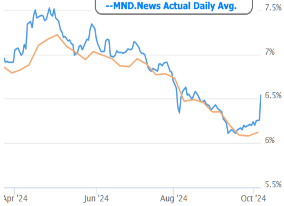
30yr Fixed Mortgage Rate Indices --Freddie Mac Weekly Survey --MND.News Actual Daily Avg.

The most important headline in the jobs report is nonfarm payrolls (NFP), which is a count of new jobs created in the most recent month (September, in this case). Not only did September's 254k payrolls crush forecasts calling for 140k, but the past 2 months were revised higher as well. This is important because recent payroll data factored into the Fed's decision to cut rates by 0.50% two weeks ago. Whereas the trend looked to be trailing off at weaker and weaker levels, it now looks a bit more resilient (mainly because the low point from 2 months ago is now higher than the low point from earlier in the year).