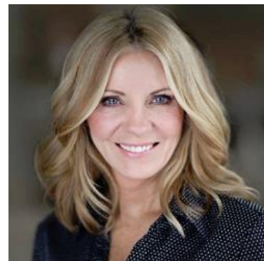
Christina "Demo" Realtor

Managing Partner, Real Estate Company, LLC.