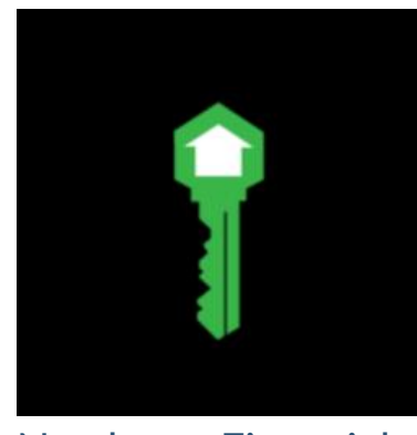
Northeast Financial LLC

www.northeast-mortgage.com P: (844) 788-7237 48 Meriden Rd, Suite 1